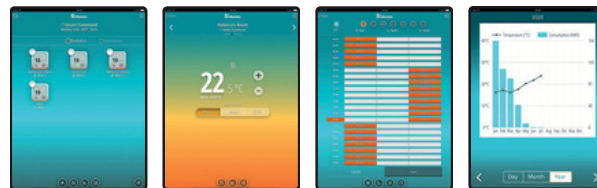
Home overview Radiator detail Programming Energy/temp use

Use your mobile device to control temperatures and operating times while viewing energy consumption for each room in your home with our app.